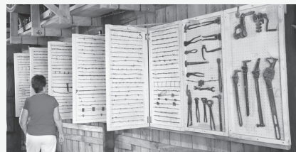
Barbed Wire Collection